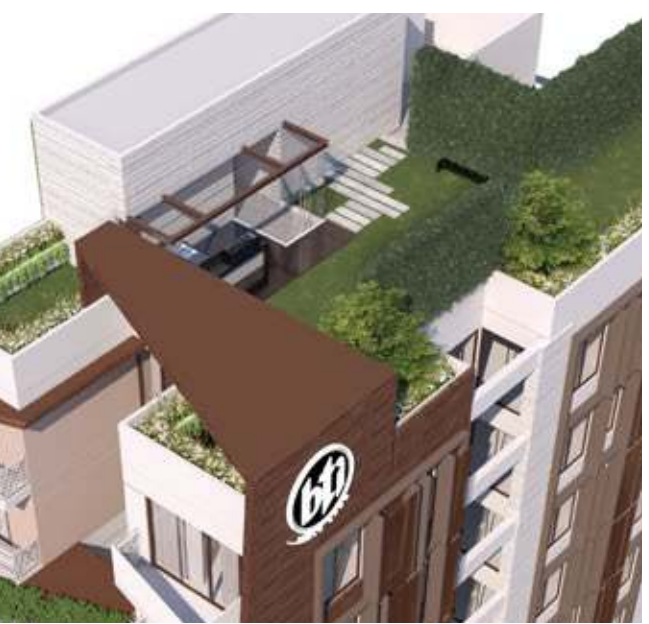
SILVER CREEK, BANANI